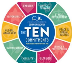
Monday, September 25, 2023 7:00PM to 9:00PM

Join us for our September dinner discussion!