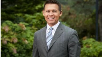
Monday, September 18, 2023 6:30PM to 9:00PM